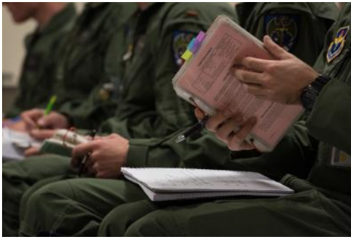
Aviation candidates study military flight procedures at Doss Aviation.